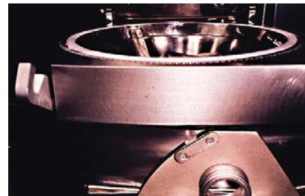
Seals for processing equipment made from Quadrant Engineering Plastic Products' TIVAR® H.O.T. are used in food, chemical, medical and other industries.

Finally, if the higher operating temperature UHMW-PE is also FDA and USDA compliant, it becomes the ideal material choice for wearstrips in proofing ovens or food dehydrators, as seals for chemical or medical processing equipment and as rollers and sprockets in food processing equipment.