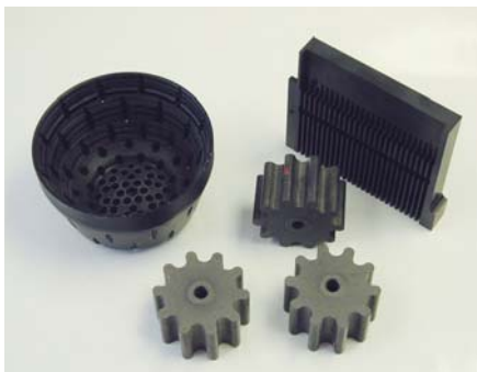
Examples of compression molded shapes of high-temperature plastics include a mold for making paper bowls made of 40 percent glass polyphenylene sulfide (PPS), gears made of 40 percent glass filled PPS, and a tray for charring computer chips made of a static dissipative polyetherimide (PEI) materials.